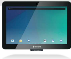
NQuire 1000 Manta II Micro Kiosk