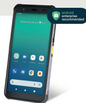
NFT10 Pilot Pro Mobilcomputer