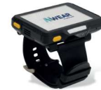
WD1 Watch Nwear