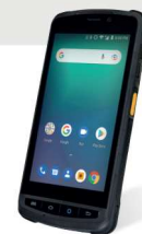
MT90 Orca III Mobile Computer