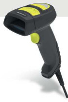
HR42 Halibut HD Handheld Scanner