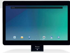
NQuire 1500 Mobula Micro Kiosk