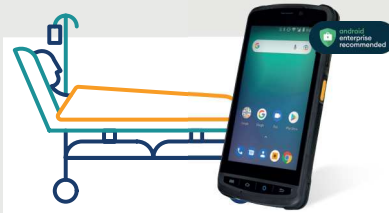
MT90 Orca Pro II Mobile Computer