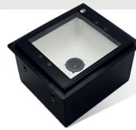
FM3080 Hind Stationary Scanner