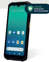
MT95 Kambur Pro Mobile Computer