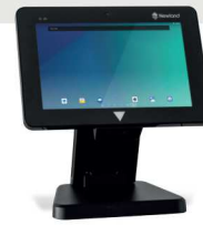
NQuire 750 Stingray Micro Kiosk