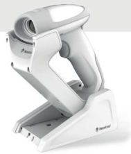
HR32 Marlin Bluetooth HC Handheld Scanner