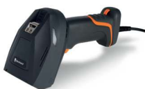
NVH300 Angler HD Handheld Scanner