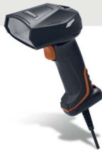
NVH300 Angler DP Handheld Scanner