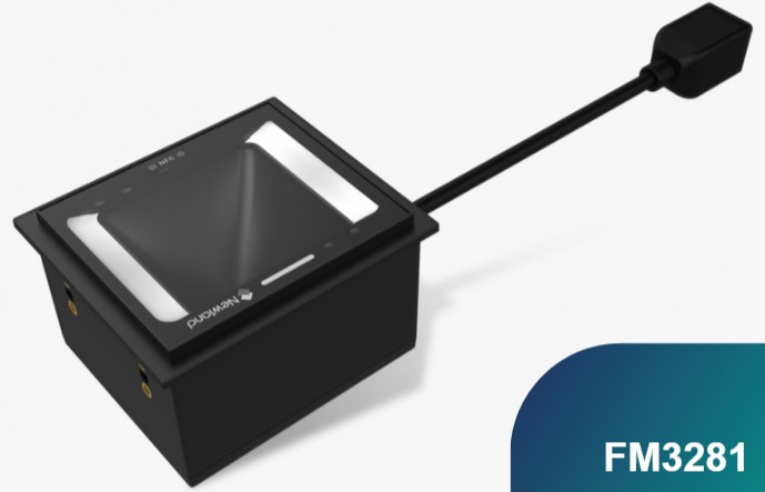
FM3281 Grouper Stationary Scanners