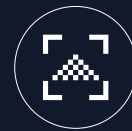
1920*1080 Screen resolution