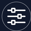
Rich interface extensions