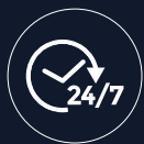
Running 24/7 without affecting reliability