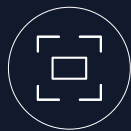
15.6 inch screen